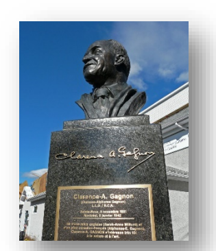
Example of a statue of a landscape artist

You will be able to use this map in the written part of the fieldwork exercise to help you remember what you are seeing today.